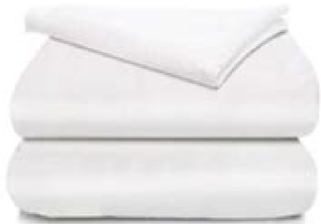
Is percale better than egyptian cotton. Are percale sheets better than cotton. Is percale 100 percent cotton. What is brushed cotton percale. Is cotton percale good for sheets.